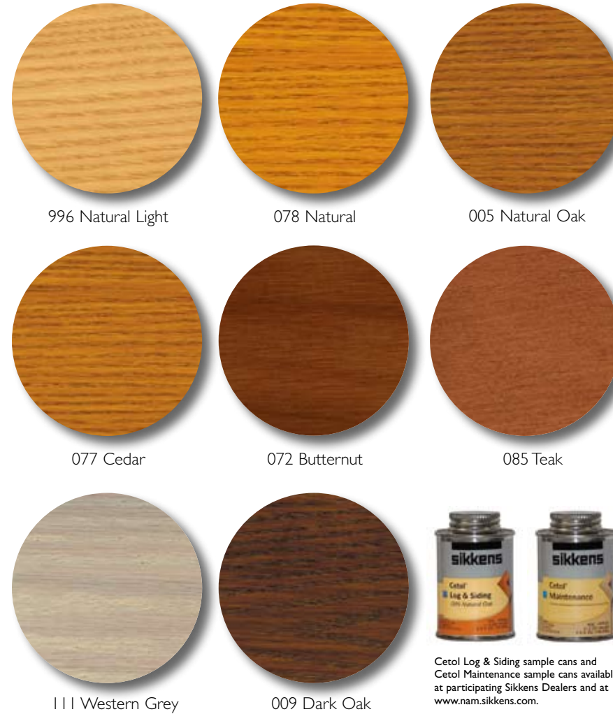
Cetol Log & Siding sample cans and Cetol Maintenance sample cans available at participating Sikkens Dealers and at www.nam.sikkens.com .

Note: Printed colors shown here may vary from actual product colors.